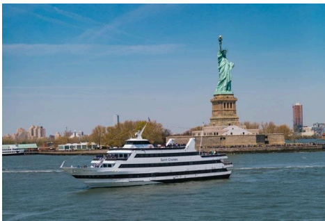
The Spirit of New York at the Statue of Liberty